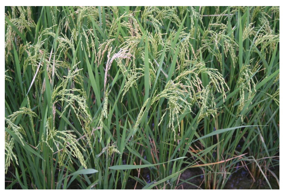
Yellow stem borer - white ear damage in Rice var. Co-52

Pest Status : Moderate to severe incidence of yellow stem borer with 8.0 per cent white ears Co-52 and 6 per cent in Co-51.