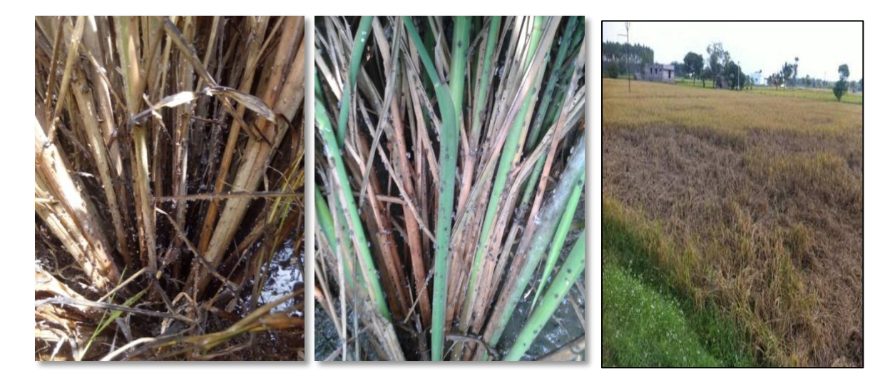
BPH damage at Aduthurai

Varieties grown: BPT5204, CR 1009, ADT 46, and ADT49Crop Stage: Samba crop: 90-120 DAT; Thaladi crop: 60-90 DATPest Status: Moderate incidence of BPH.